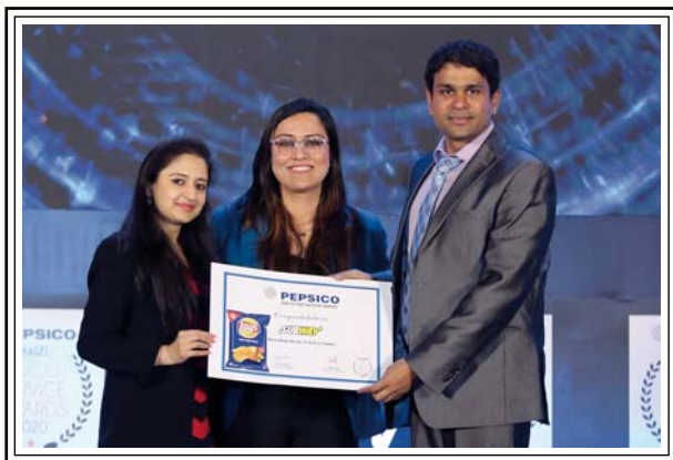
PEPSICO SNACKS PARTNERSHIP AWARD FOR SPREADING SMILES IN EVERY COMBO