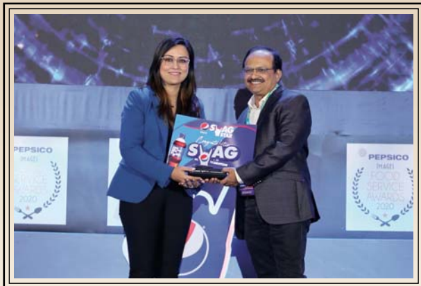
PEPSICO SWAG STAR AWARD FOR WOW BRAND INTEGRATION